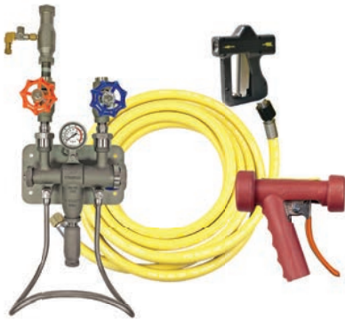
Wash Down Equipment

Headquartered in Bethlehem, Pennsylvania, USA, Strahman Valves, Inc. is a world-wide leader in the manufacture of high quality Wash Down Equipment and Industrial Valve products. Since its inception in 1921, the Company has earned a global reputation for reliable products that provide superior performance, innovative solutions to complex problems and long-term reliability. Strahman has become known as the standard for numerous industries including the chemical, petrochemical, polymer, biotechnology, pharmaceutical, food processing, beverage, dairy, mining, and pulp and paper.